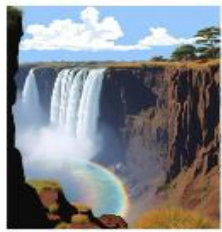
VICTORIA FALLS ZIMBABWE