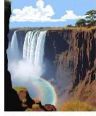
VICTORIA FALLS Paradise