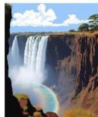
VICTORIA FALLS ZIMBABWE