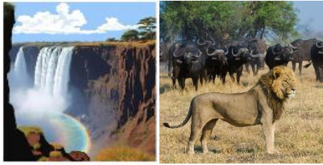
VICTORIA FALLS ZIMBABWE